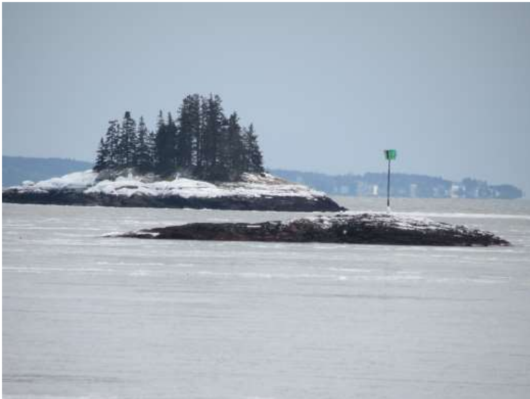
Scene from my field site. More on February tides later.