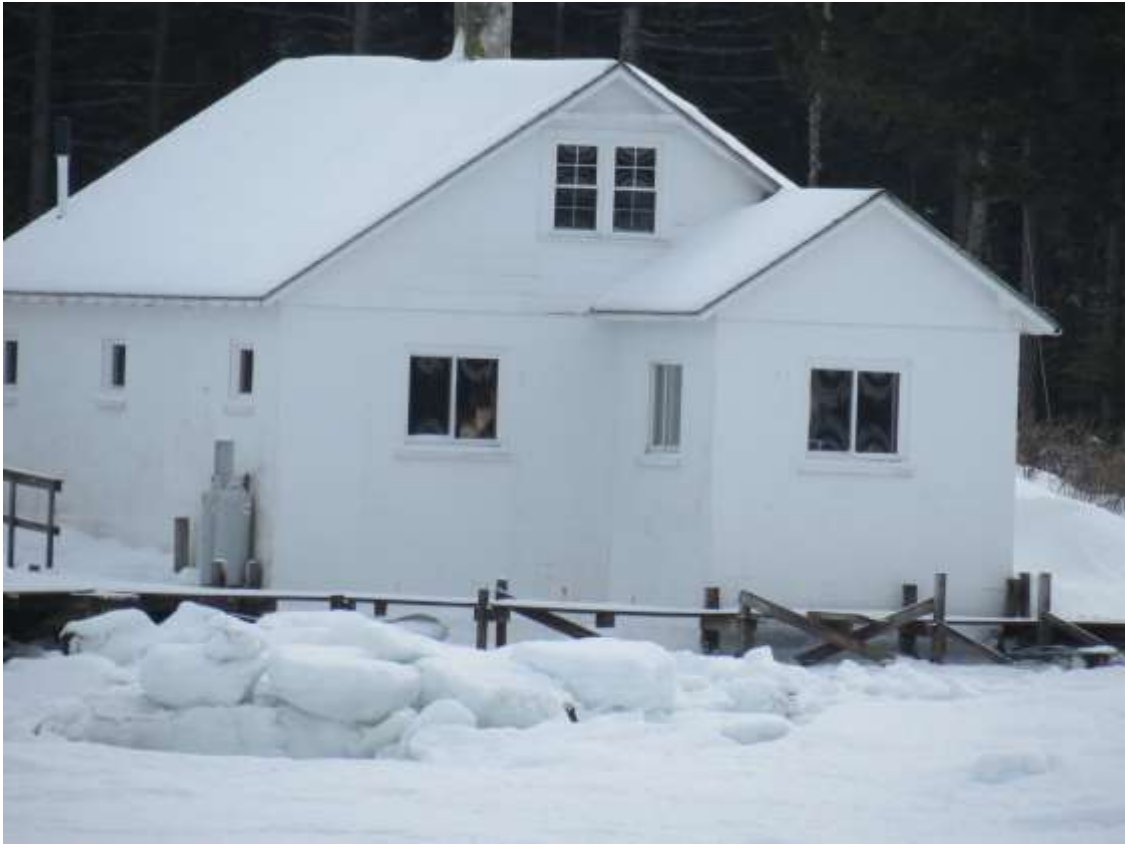
Camp on Little Morse Island, aka “Lobster Learning Center” sitting pretty.