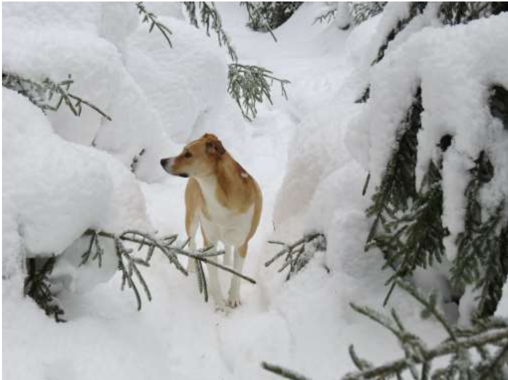
Woods deep deep deep in snow.