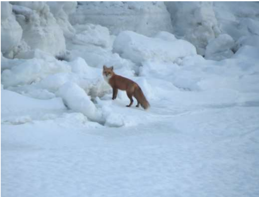
Handsome Red Fox island neighbor looks on and wonders, "Is there enough to share with me?"