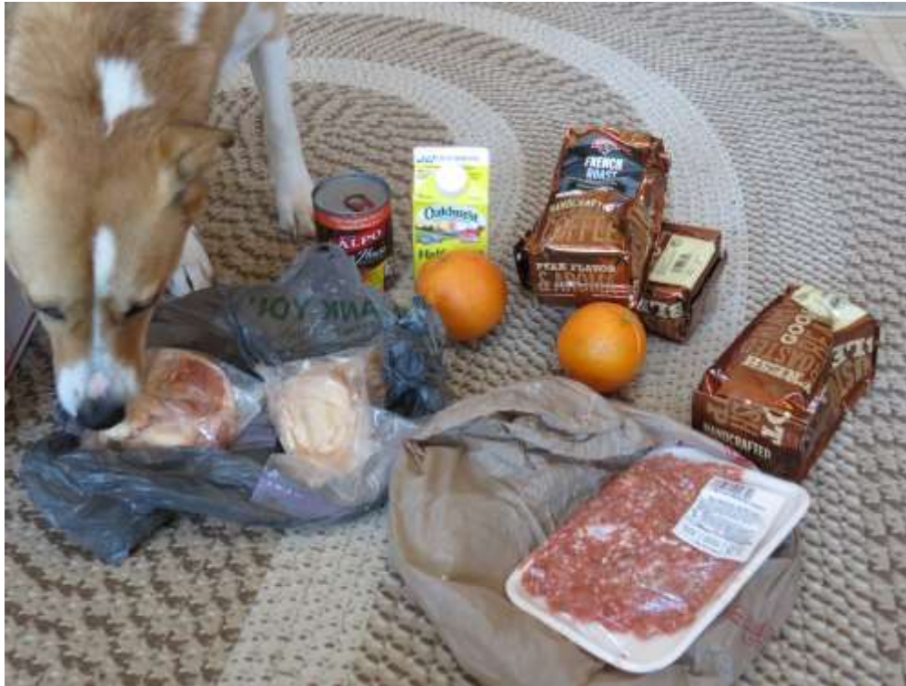
Contents of the first package found. Sula is fascinated!