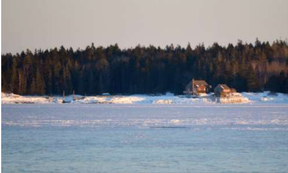
View of here from over there.